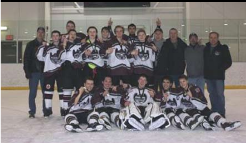
CO112, Midget Red winners of the Ange Giajnorio Memorial Midget Select Tournament