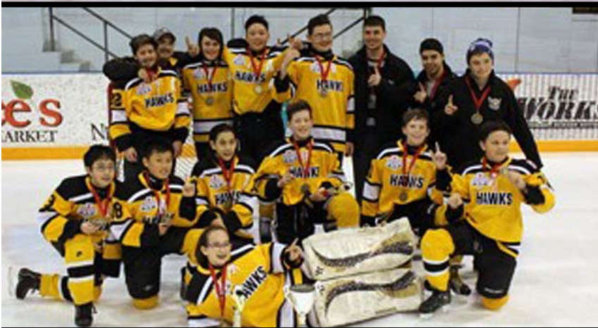
ME73, Peewee White winners of the Newmarket March Break House League Tournament