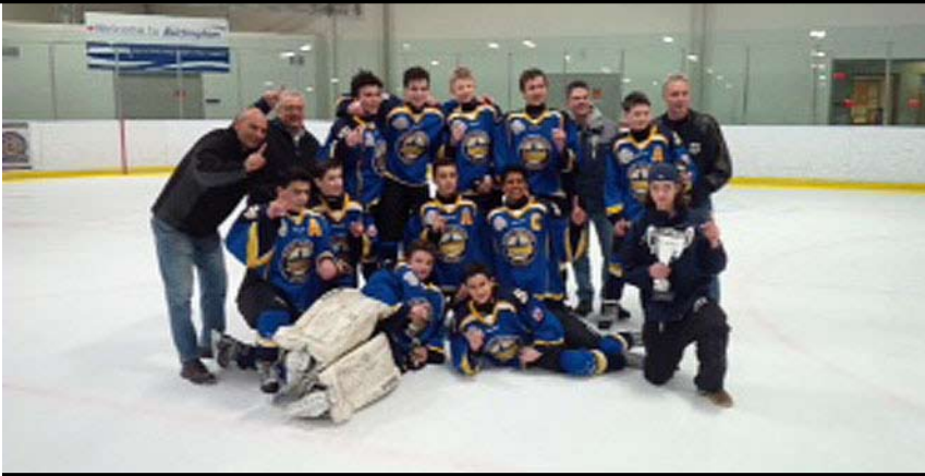
PC091, Bantam White winners of the Burlington Spring Break Tournament