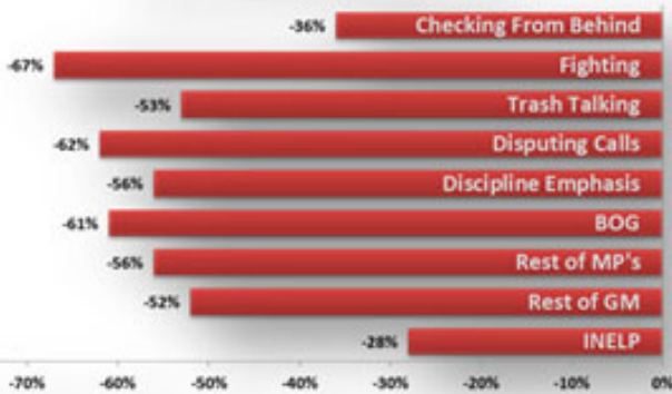
Q10: Suspensions Change from 2013-14 to 2014-15 YTD

Without the concerted efforts of the MHL on ice officials and Discipline Committee, this would not have been possible.